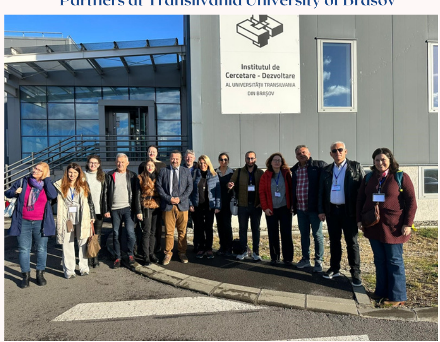
Partners at Transilvania University of Brasov

We're making significant strides in creating more inclusive and multicultural classrooms. Your support is invaluable to us, and we can't wait to share more updates as we move forward. Stay tuned, and keep an eye on our project website for additional resources and information.